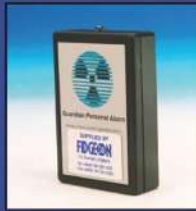
Radiation safety equipment