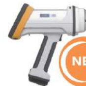
NEW X-MET7500 Mining Analyser

Designed for mining and soil applications. With NEW large area SDD for ultra low detection limits. New software to report compounds and pseudo elements.