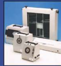
High intensity viewers