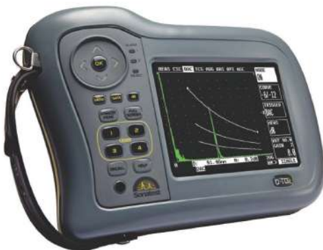
Sitiescan Flaw detectors

Sonatest has a long history of product innovation and market firsts that continues today in the latest advanced NDT testing equipment such as the VEO phased array flaw detector and Rapidscan real time 3D defect mapping.