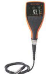
paint thickness gauge