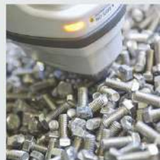
Coating thickness measurement