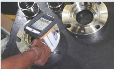
Positive material identification (PMI)

Tektraco are the official distributors for Oxford XRF instruments for Libya and Malta.