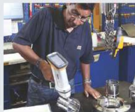
Flow accelerated corrosion (FAC) inspection